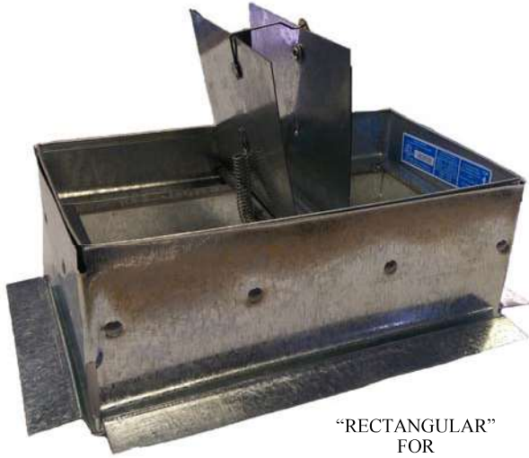
"RECTANGULAR" FOR INSTALLATIONS